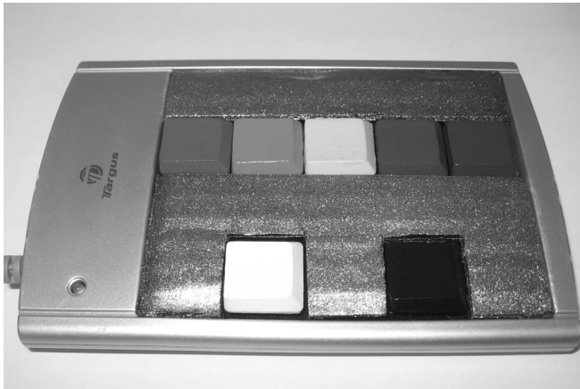
FIGURE. Customized data entry keypad with color-coded keys, created by modifying a USB number pad. Top row: red, orange, yellow, green, blue. Bottom row: white, black.

reported about 3 times the prevalence of both physical (24%) and sexual (16%) abuse, possibly indicating a higher degree of comfort in sharing sensitive information when using the confidential system.